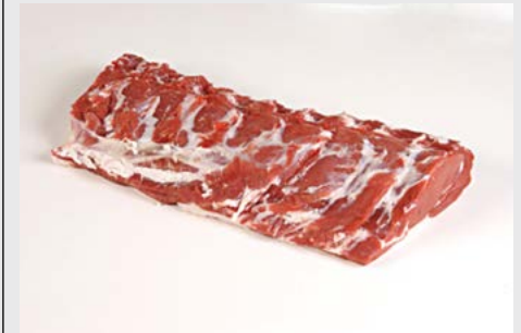
1. Position of 3 rib sirloin.